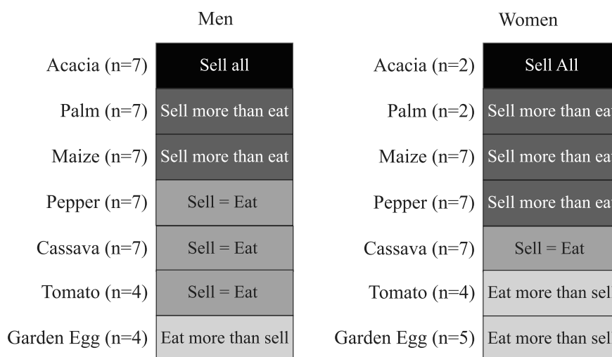
Figure 3. Visual representation of the motivations for planting the crops found on multiple men's and women's farms in the seven "market" households observed in 2005. Each block represents the average motivation for planting the crop in question among those who planted that crop (the number of men or women planting each crop is represented by an n value next to the crop name in each column). Darker colors indicate a greater market orientation in the motivation for planting a particular crop.

Under the market strategy, all members of the household produce for market sale, and so it is of little surprise that of the remaining seven crops, men view six and women view five as having at least half of their utility in market sale. Further, men and women share perceptions of use for five of these seven crops. Interestingly, women see one of these crops (pepper) as more for market sale than do men, while men saw the other (tomato) as more for market sale than do women (Figure 3). This suggests that while there are some gendered emphases in this strategy (at least when dealing with crop selection), in market households the patterns of agricultural production are influenced more by